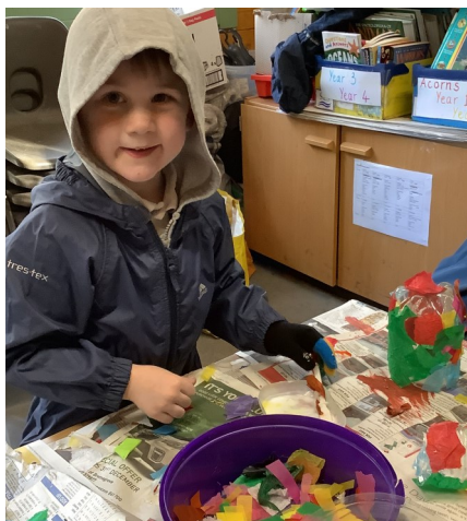
Making our lanterns.