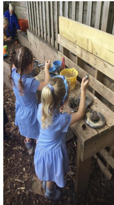
Pre-school outdoor area